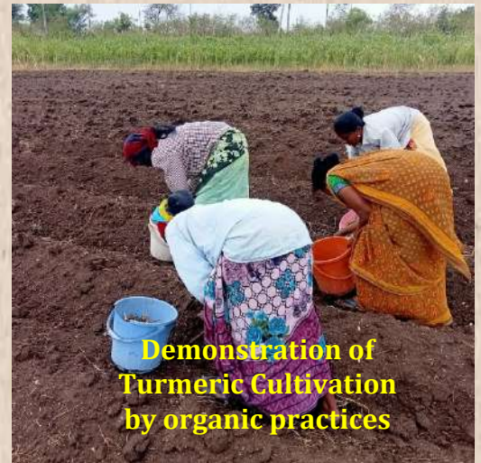
Demonstration of Turmeric Cultivation by organic practices